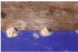
Figure 1. Larvae of powderpost beetles can reduce susceptible timber to a fine flour-like powder.

Powderpost beetles belong to the subfamily Lyctinae in the family Bostrichidae. They are so named because their larvae can reduce susceptible timber to a fine flour-like powder (Figure 1).